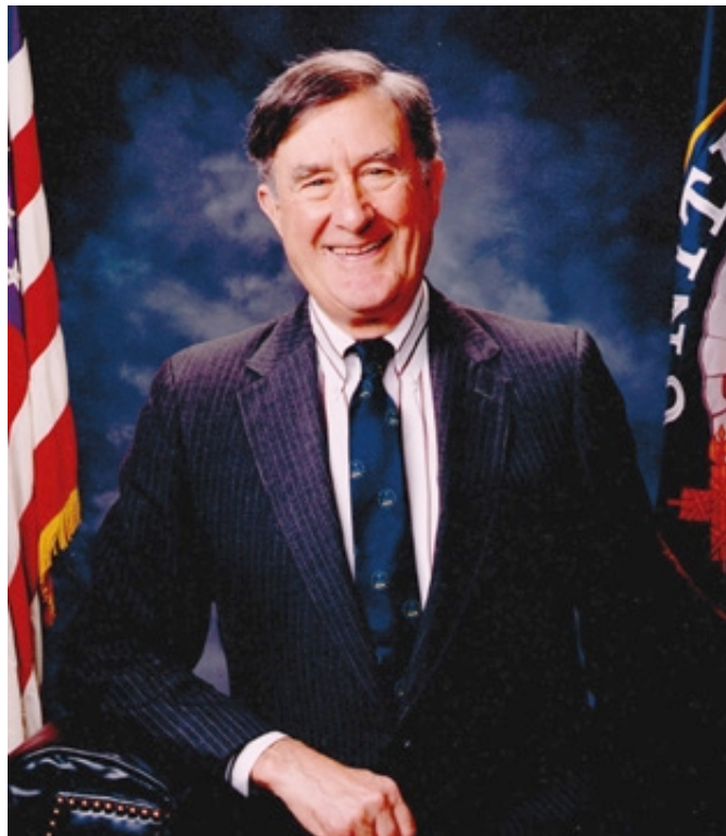
The late Senator John H. Chafee.

by all. His passion and dedication are to be admired and followed by us all."