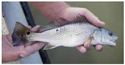
Juvenile red drum captured as past of Georgia DNR's youngof-the-year survey.

The Commission's South Atlantic State-Federal Fisheries Management Board approved two addenda – Addendum I to the Omnibus Amendment to the Interstate Fishery Management Plans (FMPs) for Spanish Mackerel, Spot, and