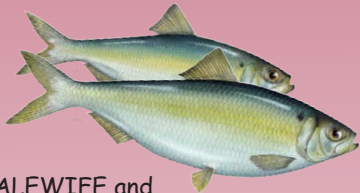
ALEWIFE and BLUEBACK HERRING