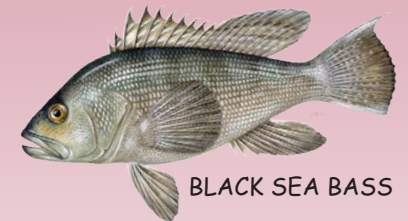
BLACK SEA BASS