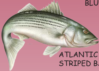
ATLANTIC STRIPED BASS