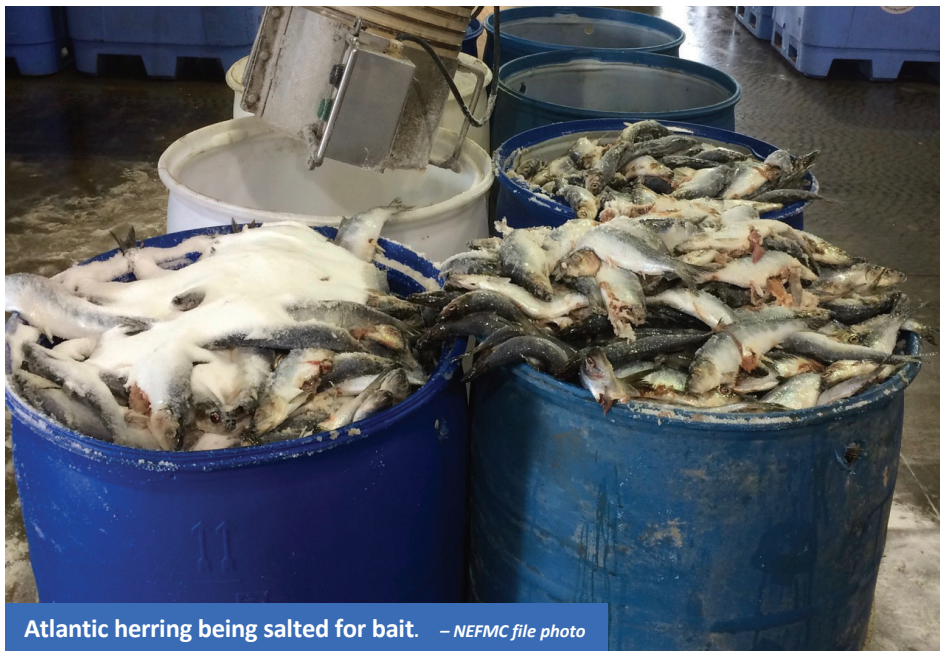
Atlantic herring being salted for bait.

The Council will continue to work on Amendment 10 along with its 2024 requirements and any other adopted priorities.