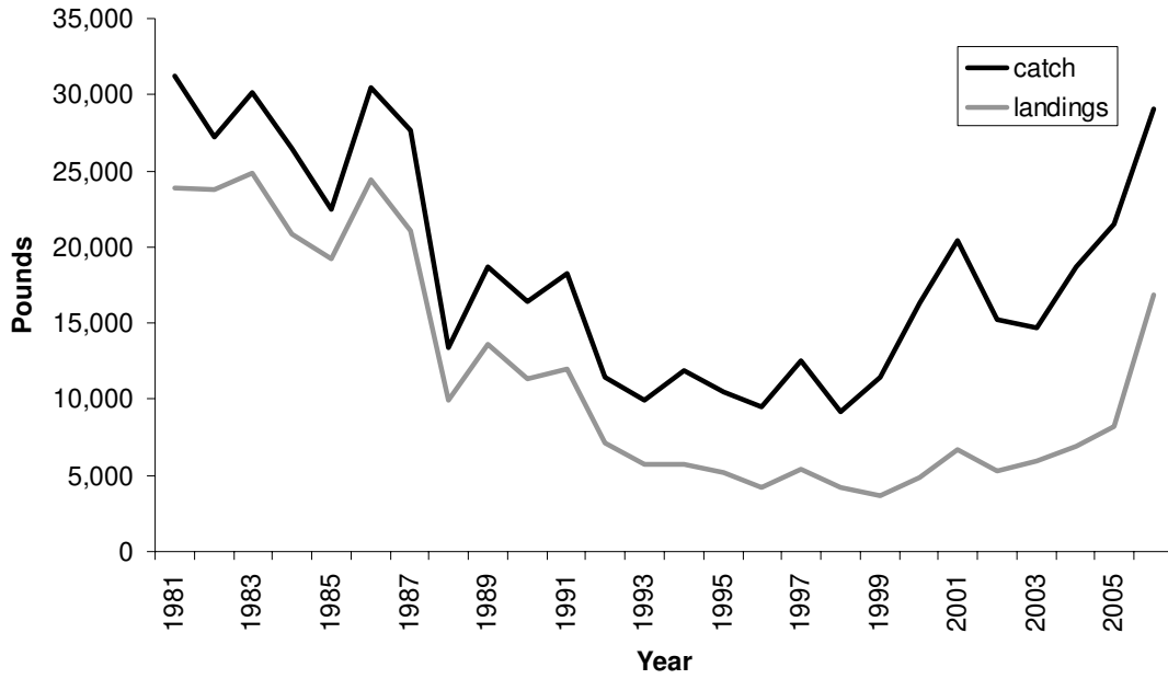
Figure 2. Bluefish commercial landings and recreational catch (thousands of pounds), 1981-2006.