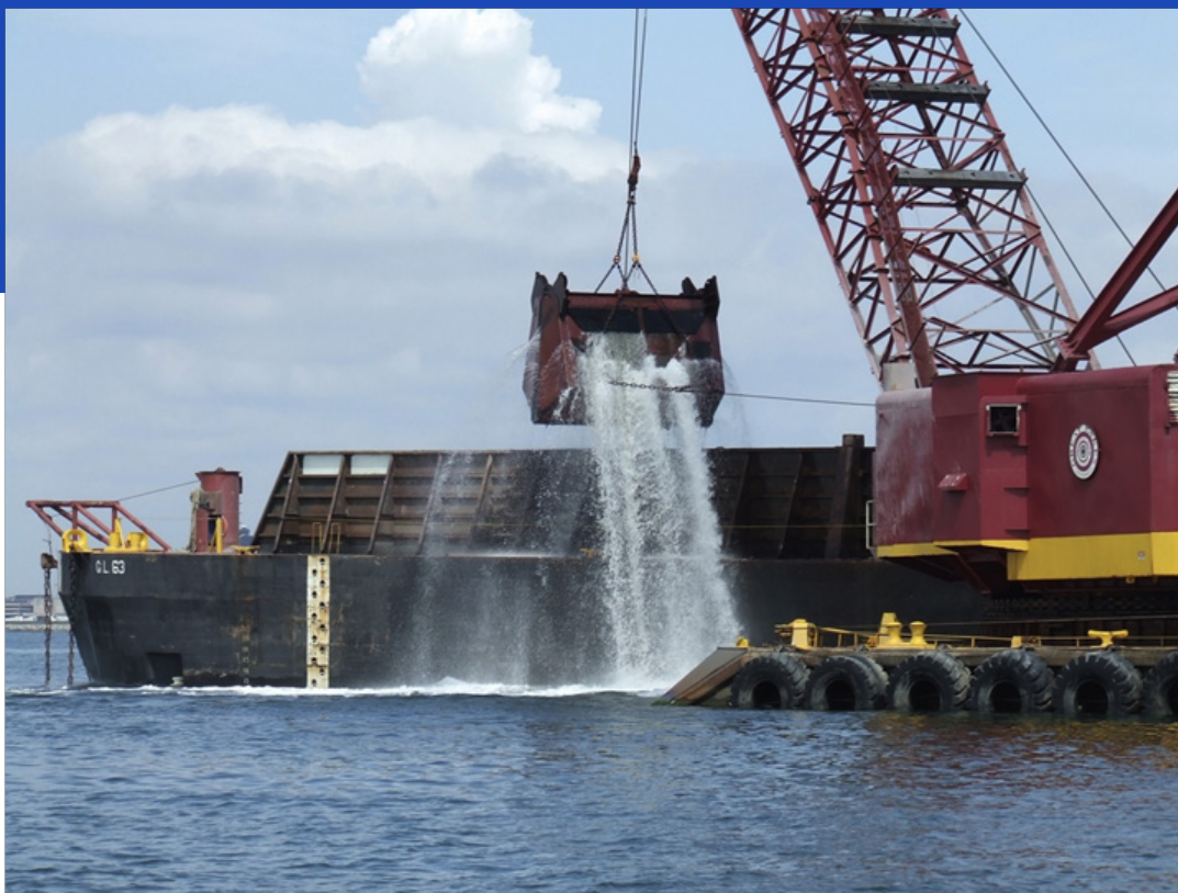
Bucket dredge using a closed bucket.

whether project effects are consistent with those envisioned within the Environmental Impact Statement. The best examples of an integrated monitoring and adaptive management program include pre-approved additional mitigation that would be triggered when monitoring shows impacts are greater than anticipated or mitigation is not performing as well as expected. Savannah Harbor is an example of such a program.