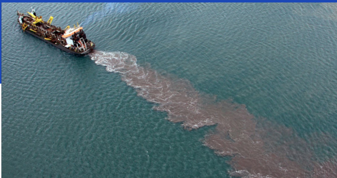
The dredger Queen of the Netherlands leaves a trail of silt as channel deepening commenced in Port Phillip Bay, February 8, 2008.