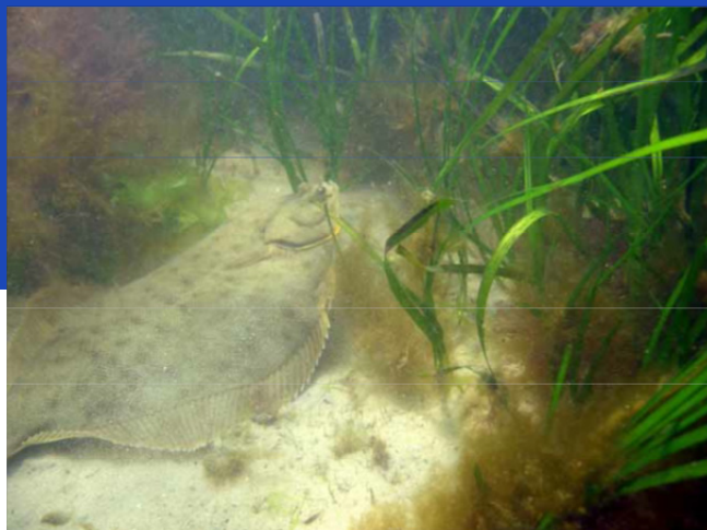
Winter flounder in submerged aquatic vegetation.