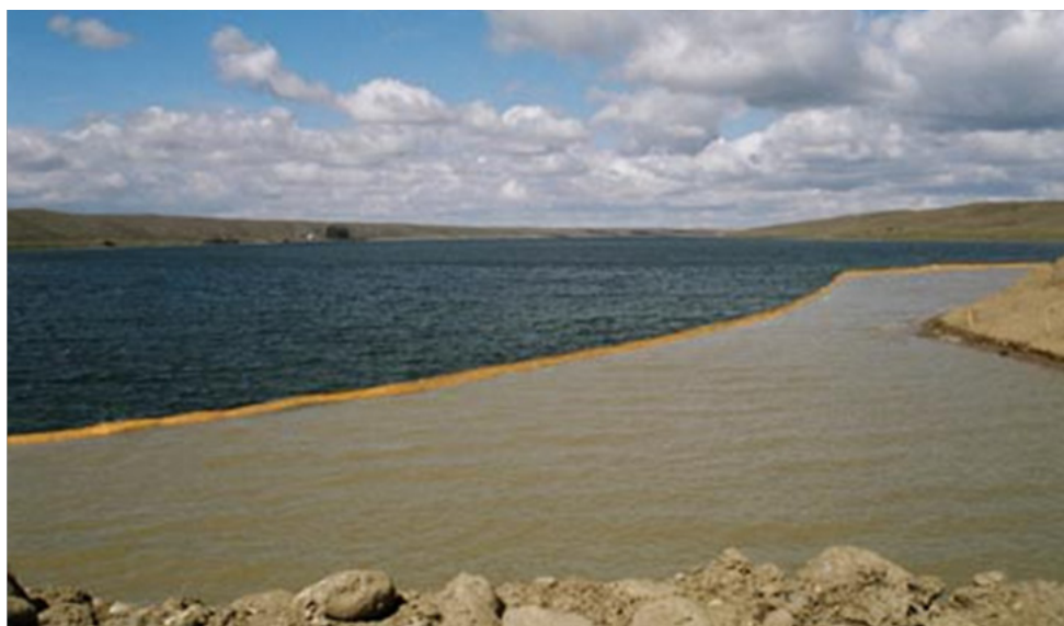
Turbidity curtain for dredging.

The mitigation for harbor deepening projects also may take an adaptive management approach. Long-term (e.g., 10 years) evaluations of deepening impacts and mitigation benefits allows a more precise assessment of