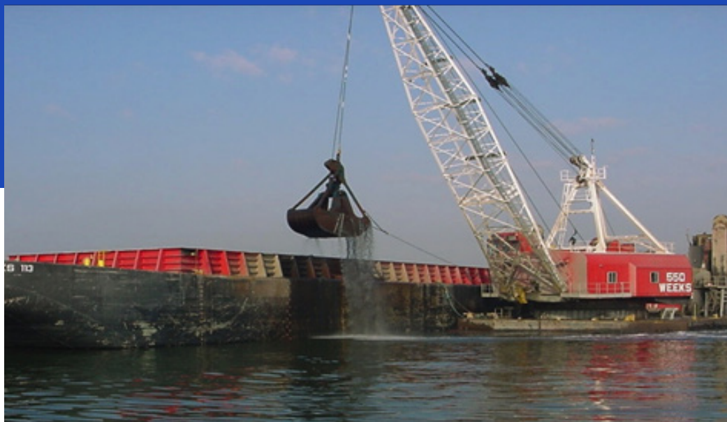
Example of a “bucket” or “clamshell” dredge loading a barge using an open bucket.

proceed only through adherence to the National Environmental Policy Act (NEPA) process, which ideally includes transparent consideration of fish habitat as an important attribute in the evaluation of project-specific merits. Awareness of the many inherent tradeoffs affecting fish habitat in deepening projects can minimize conflicts and provide insights into short- and long-term impacts and means to mitigate them.