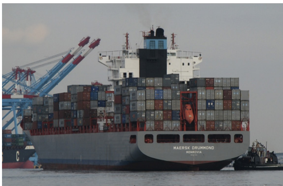
Deep draft container ship.

This document describes potential impacts to inform decision-making on future projects. Each project can