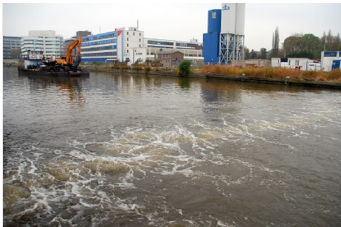
Bubble curtain in use to minimize intrusion of contaminated water.