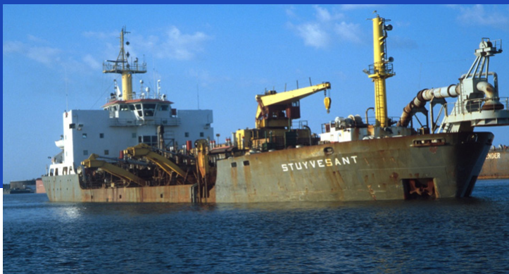
Hopper Dredge.