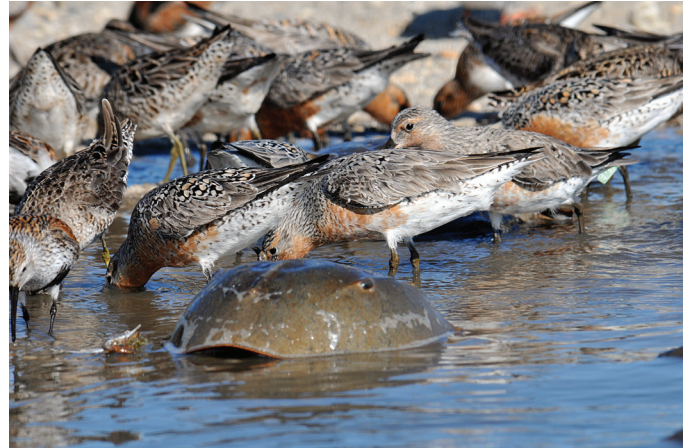
Red knots feeding on horseshoe crab eggs.

In the past 40 years, research has been conducted regarding the abundance and diets of blue catfish in Virginia. Early forecasts of abundance estimates from Virginia rivers suggested that over a million blue catfish could exist in the Chesapeake Bay. However, it is unlikely that blue catfishes are spread uniformly throughout the watershed because of habitat differences among and within rivers, and preferences for certain habitats. Research has shown the species achieved high abundances in Virginia rivers and consumed both fish and macroinvertebrates, having a