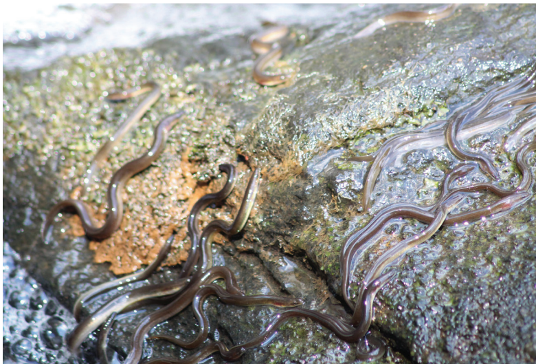
American eel at Swift Creek Dam, VA.

The Commission periodically conducts stock assessments for American eel ( Anguilla rostrata ) in support of fisheries management for Atlantic coastal states. The Commission requested assistance from the USGS-LSC to evaluate if and how geographic