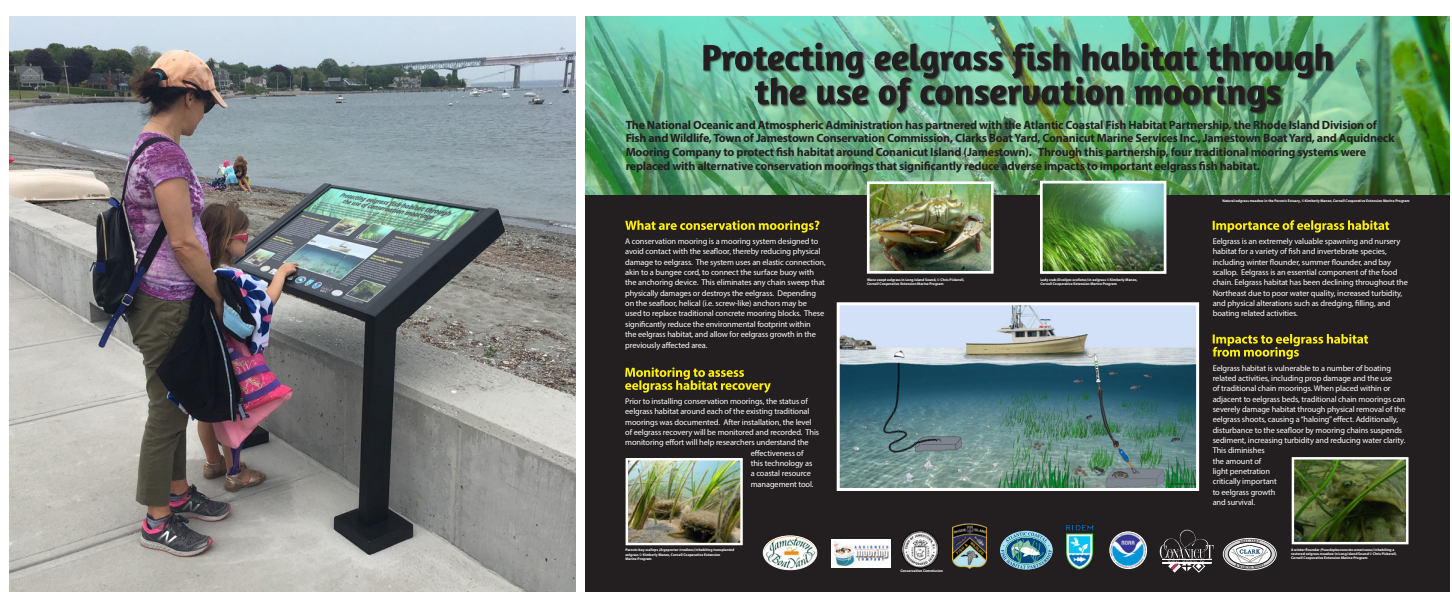
Figure 2. Seagrass habitat conservation signage in Jamestown, Rhode Island. Photo and sign courtesy of the Atlantic Coastal Fish Habitat Partnership.

Action: ASMFC, States, and Federal Partners — ASMFC in coordination with member States, federal agencies, and non-profits will promote and support the improvement of policy maker and public understanding of the value, habitat requirements, status, significant threats, cumulative human impacts, and trends in abundance of SAV. States should include this information in their aquatic education programs.